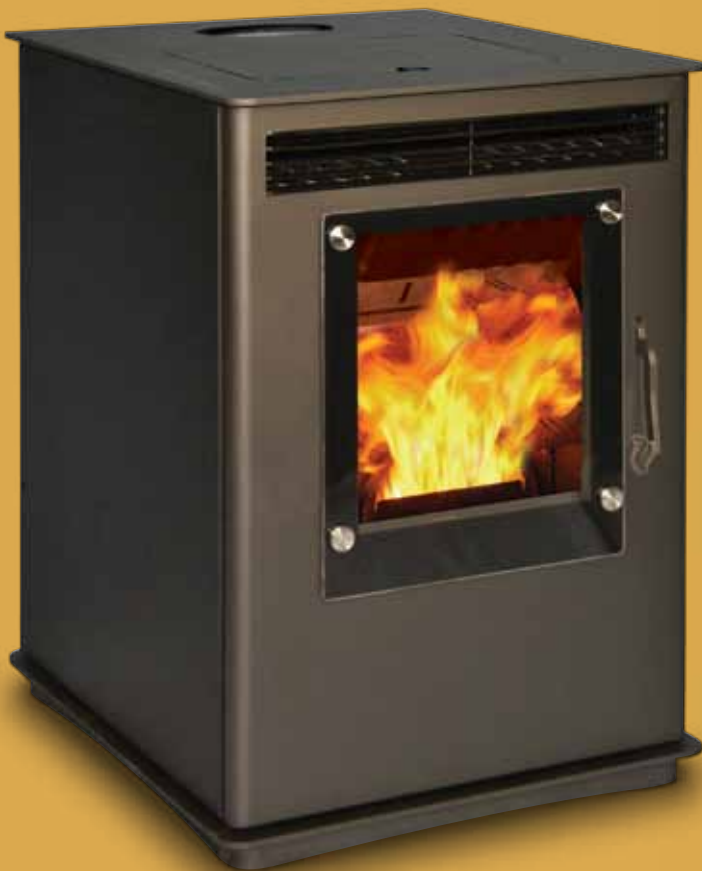
Nokomis Charcoal Metallic

The Nokomis is a contemporary, euro design, while the Itasca is a charming, elegant style.