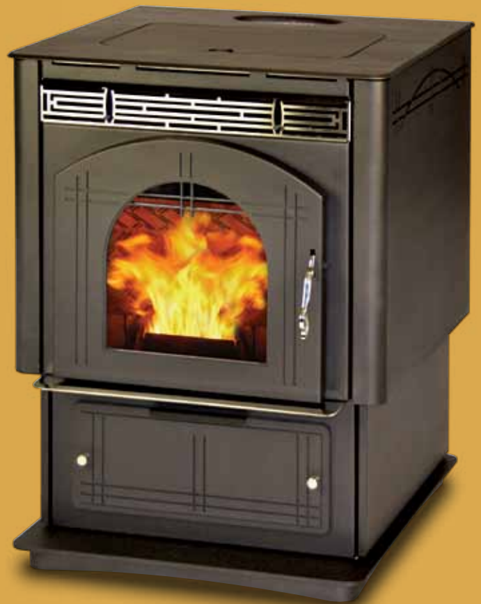
Itasca Charcoal Metallic

Utilizes all natural, 100% renewable wood pellets. Uninterrupted burning for up to 56 hours.*