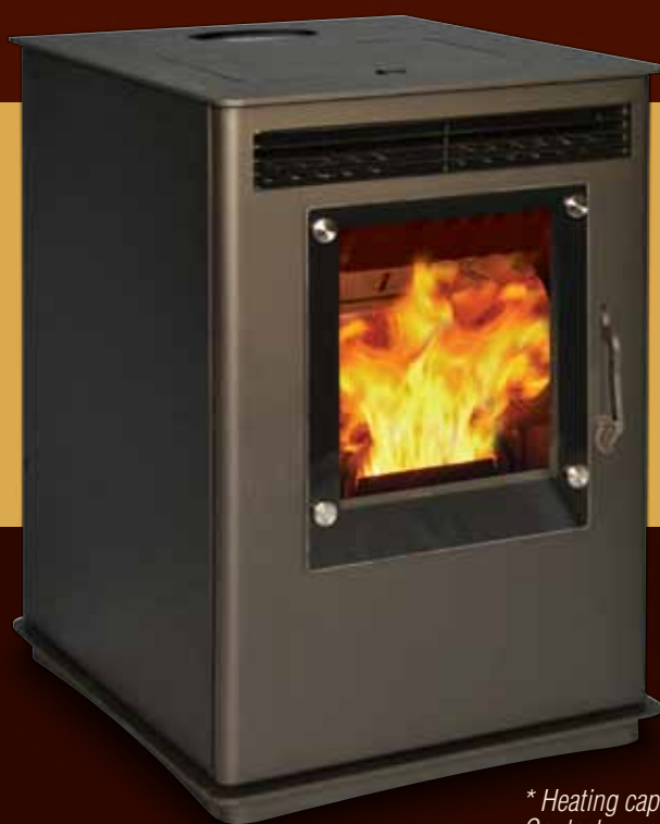
Nokomis Charcoal Metallic

Hearthland Stoves™ advanced heating technology provides unparalleled flexibility and overall performance. You choose the BTU heat output and fan speed – you get the control and comfort desired. One-touch Intelligent Temperature Control (ITC) distributes a powerful heat of up to 51,300 BTUs per hour, heating up to 2,500 square feet*.