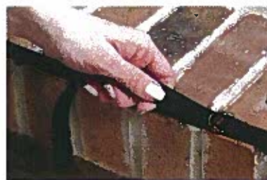
No adhesives; strap adjustment