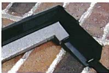
Inside non-skid cushion

The KidCo® Hearth Guard helps protect children from serious injury if falls occur on the fireplace hearth. The uniquely shaped foam profile is designed to provide a cushiony soft protective surface; and by simply cutting the center foam section, the entire unit provides a custom fit for hearth lengths up to 8'. The two steel and foam corner pieces protect up to 18" of hearth sides. By pulling tight the strap that connects the steel corner pieces, the entire unit will snugly hug the corners of the hearth with a non-skid cushion; also preventing damage to smoother hearth surfaces like marble, slate or drywall. The foam is held in place with the innovative strapping system. Best of all, there is no sticky, messy adhesive required!