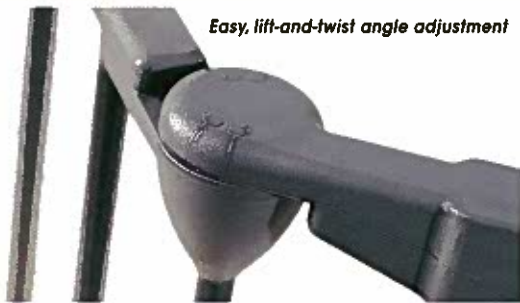
Easy, lift-and-twist angle adjustment

The HearthGate is 29 1/2" high and constructed of strong tubular steel with a black, non-toxic, heat resistant finish that is easy to maintain and blends with any decor. If White finish is desired, the ConfigureGate ® can be substituted.