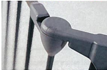
Easy, lift-and-twist angle adjustment