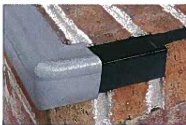
Steel/foam corners provide stability