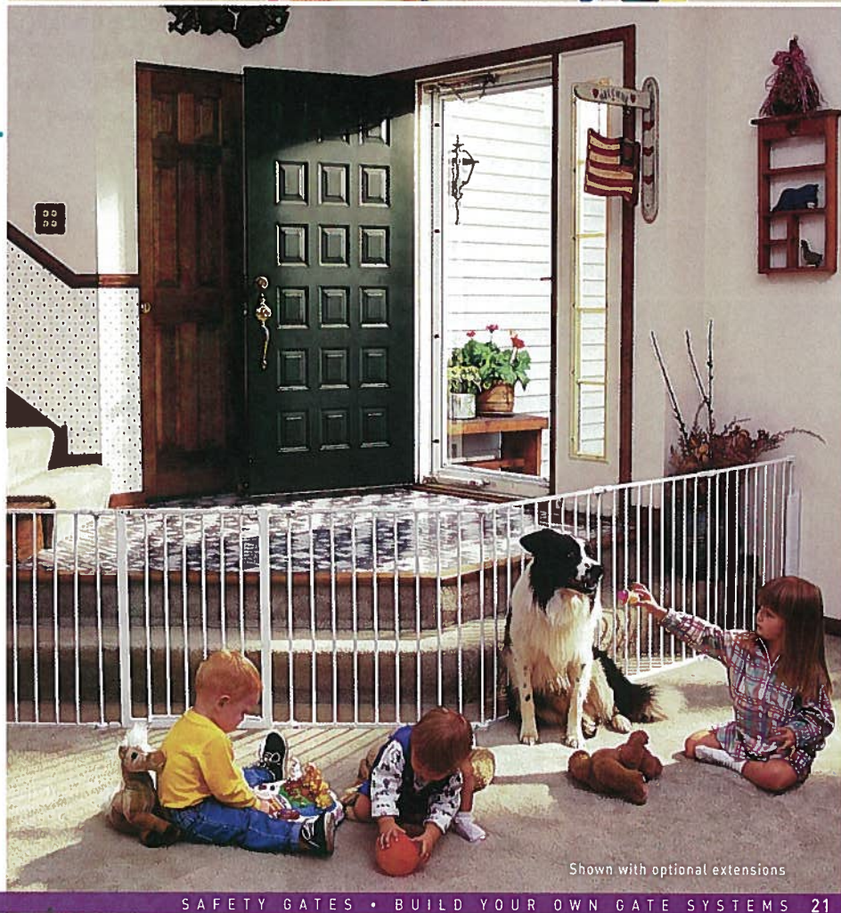
Shown with optional extensions